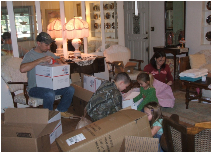
This young mom and dad teach their children about politics, geography, hard work and team building all in an afternoon at a packing party for Afghanistan.